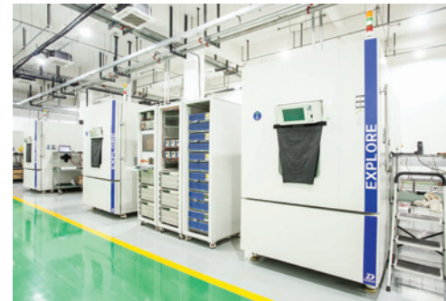
Testing facility for standards certification

intelligence (AI) has also been increasing.