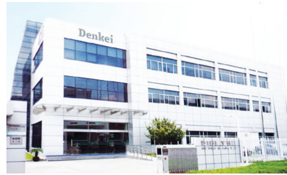
Denkei Technology R&D (Shanghai) Co., Ltd. Denkei Trading (Shanghai) Co., Ltd. Puxi office

In order to meet diverse needs of growth industries, Nihon Denkei handles increasing number of new commercial materials. Main commercial materials include automotive testing systems, such as camera monitor systems, driving simulators, and radar alignment systems. Among equipment contributing to labor-saving measures include automatic assembly machines, robot systems, transfer systems, and electric furnaces. Handling of commercial materials related to artificial